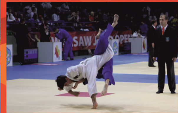
Dedicated places for coaches. White and blue judogi in U18, U21.