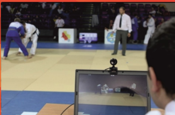
Care-system and Live TV for all tatamis.