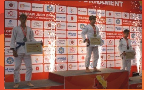
Dedicated medals for WJO Diplomas made of Egyptian papyrus