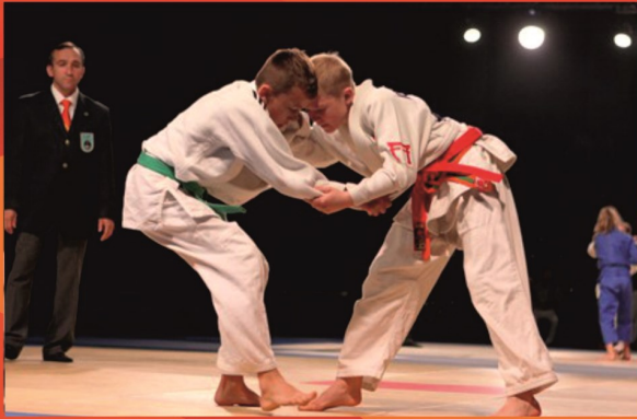
Final block in spotlights with music.